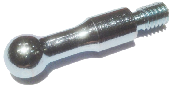
Threaded Ball Stud™ Patent No.: US 9,211,027 B2