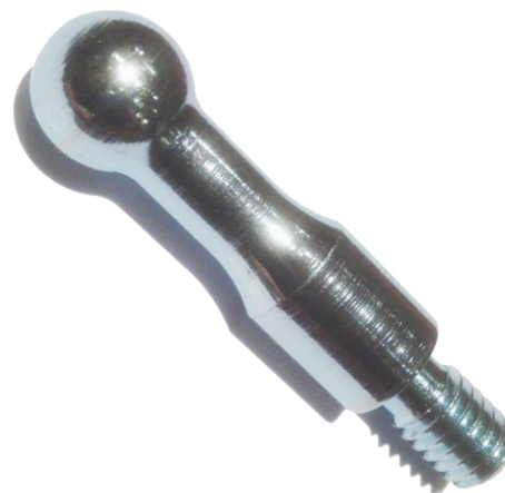
Threaded Ball Stud™ Patent No.: US 9,211,027 B2

Use the Threaded Ball Studs™ with standard threaded inserts from any hardware store to secure flats, signs, and other decorative elements to your set.